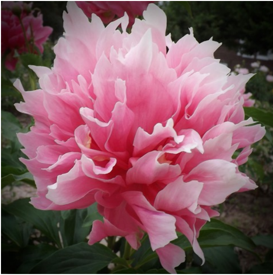
Elizabeth Black, Seidl / Bremer