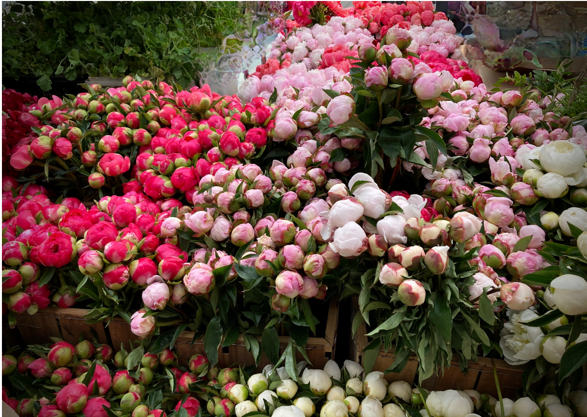
Peonies for sale on a NY City street.

experience as a WPS Member. Feel free to email me at wipeonysociety.president@gmail.com