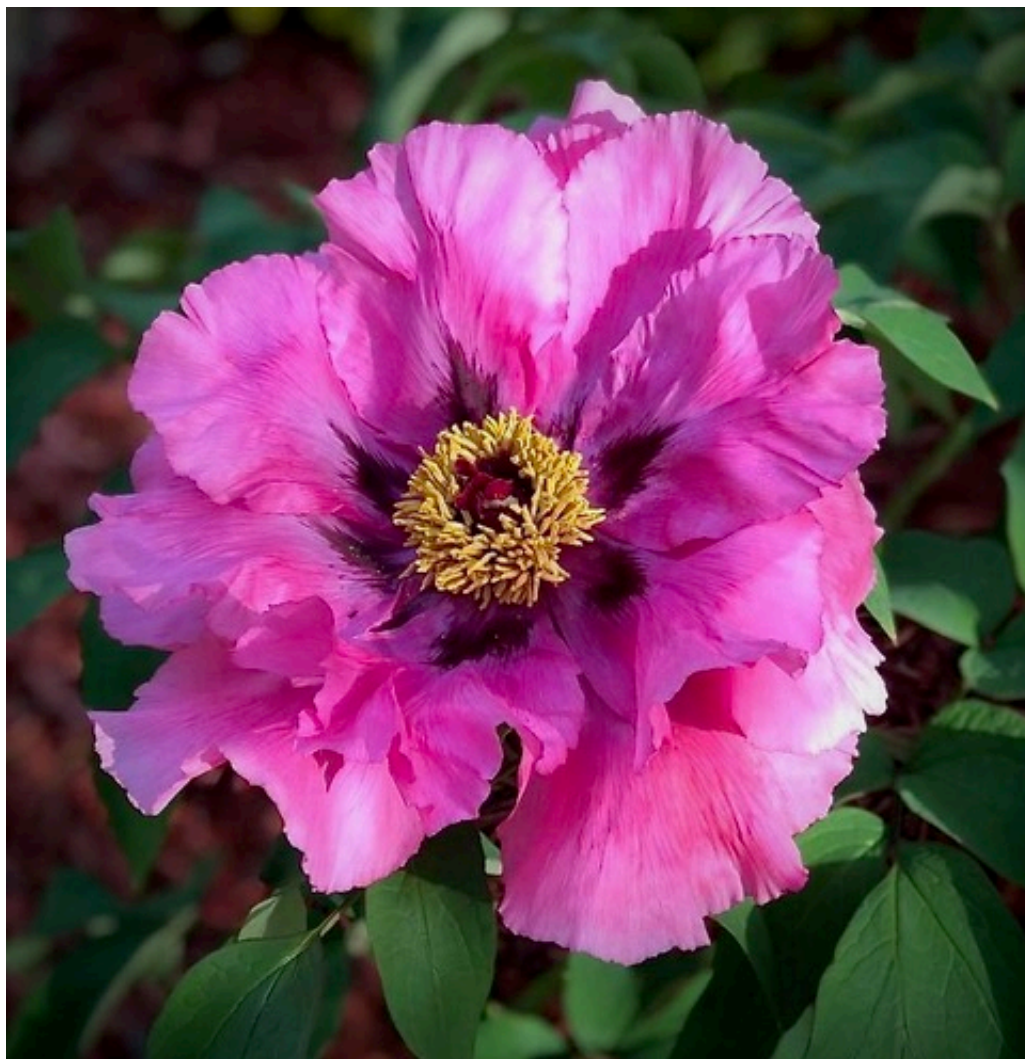
Lloyd Ravet seedlings.