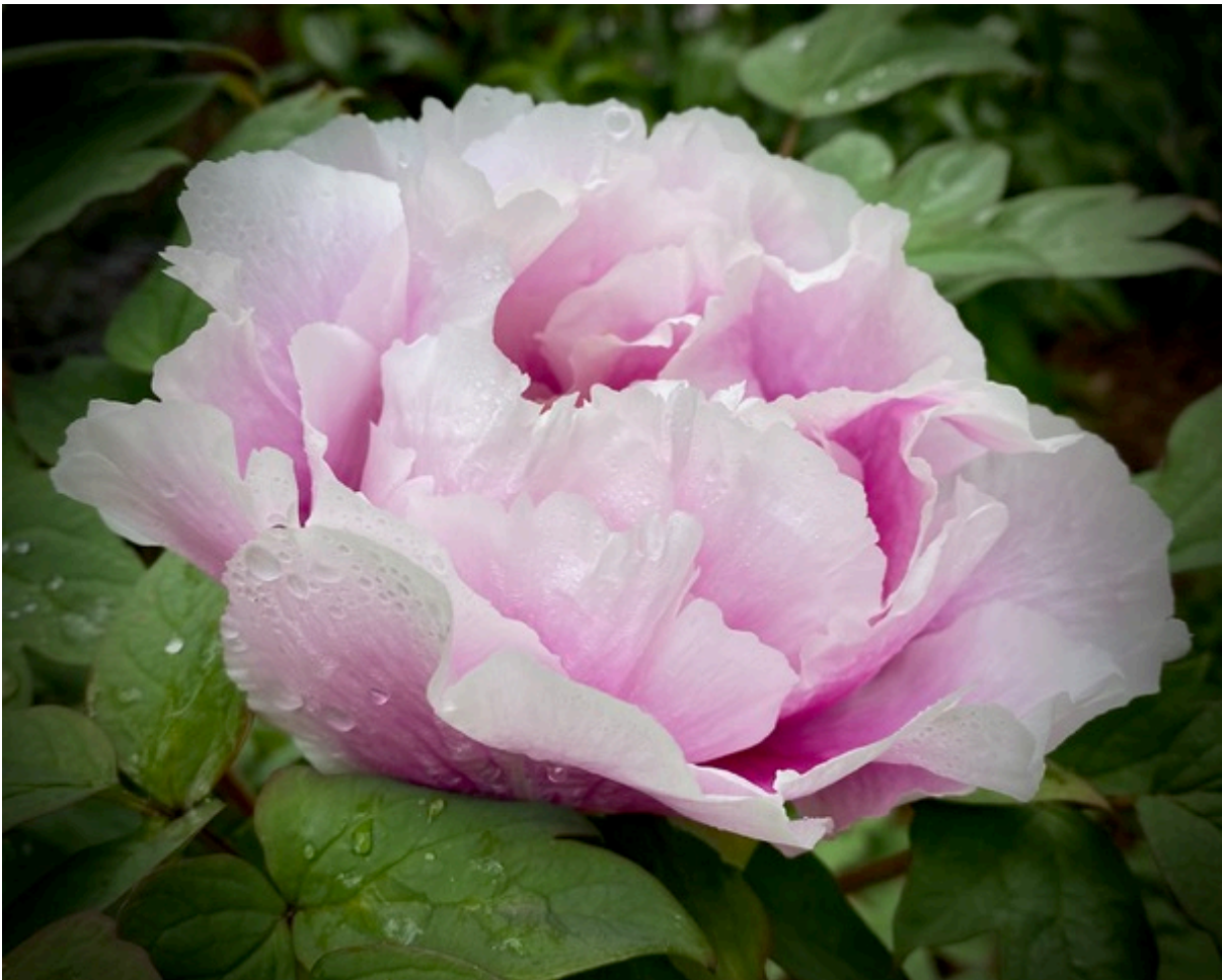
Lavender Hill, Seidl.