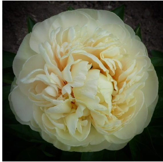
Sunny Boy, Laning