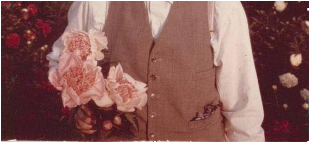
Peony 'Auten's Pride, 1933